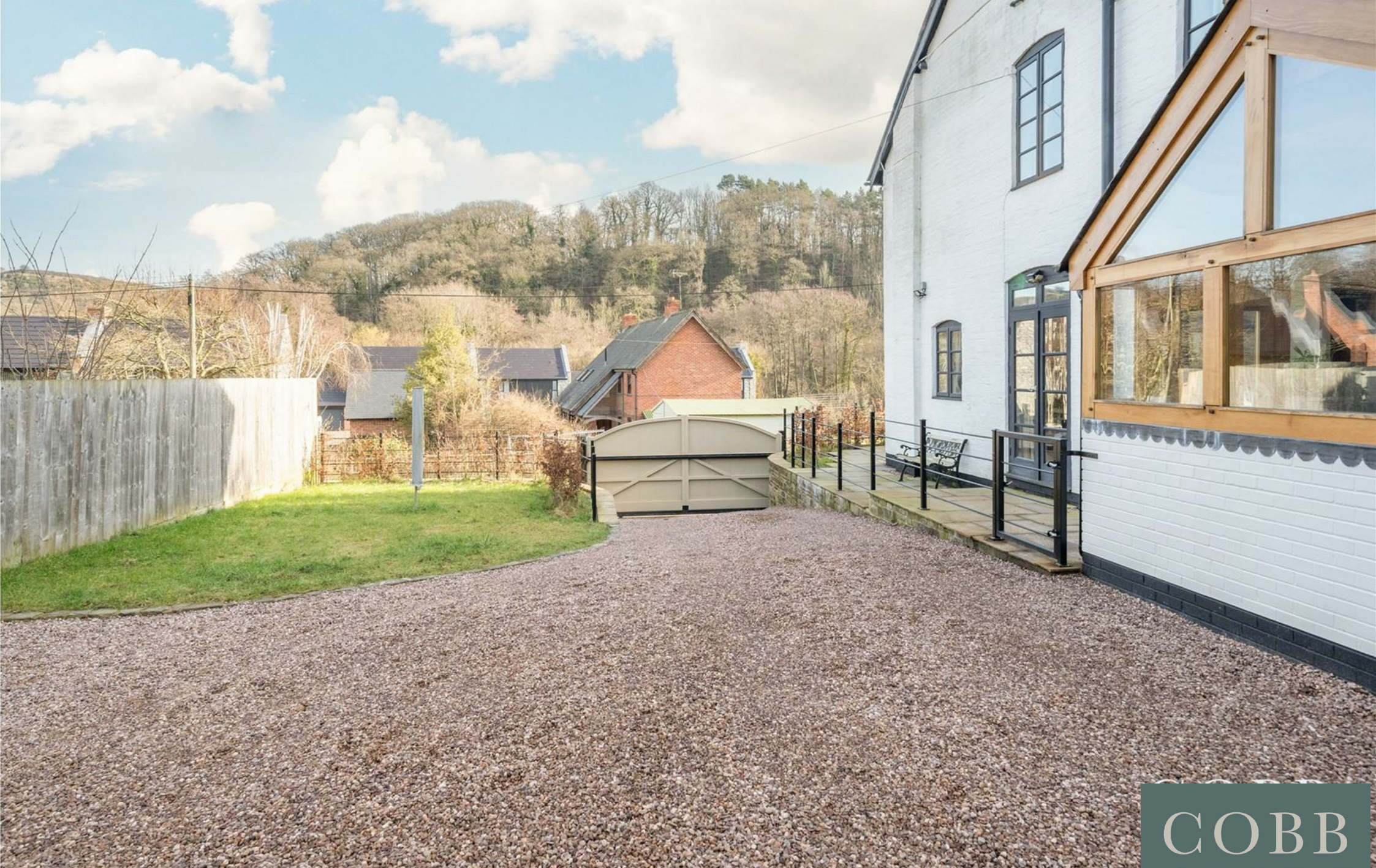
Old Post Office Cottage, Lingen, SY7 0DY Price £390,000